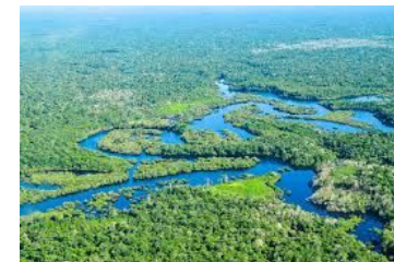
Aerial photos of Amazon Rainforest