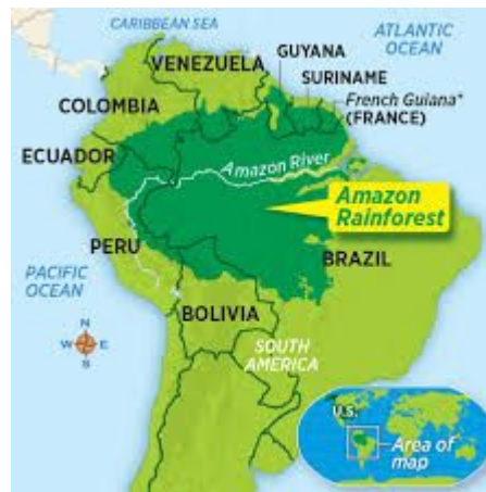
Map of Amazon Rainforest