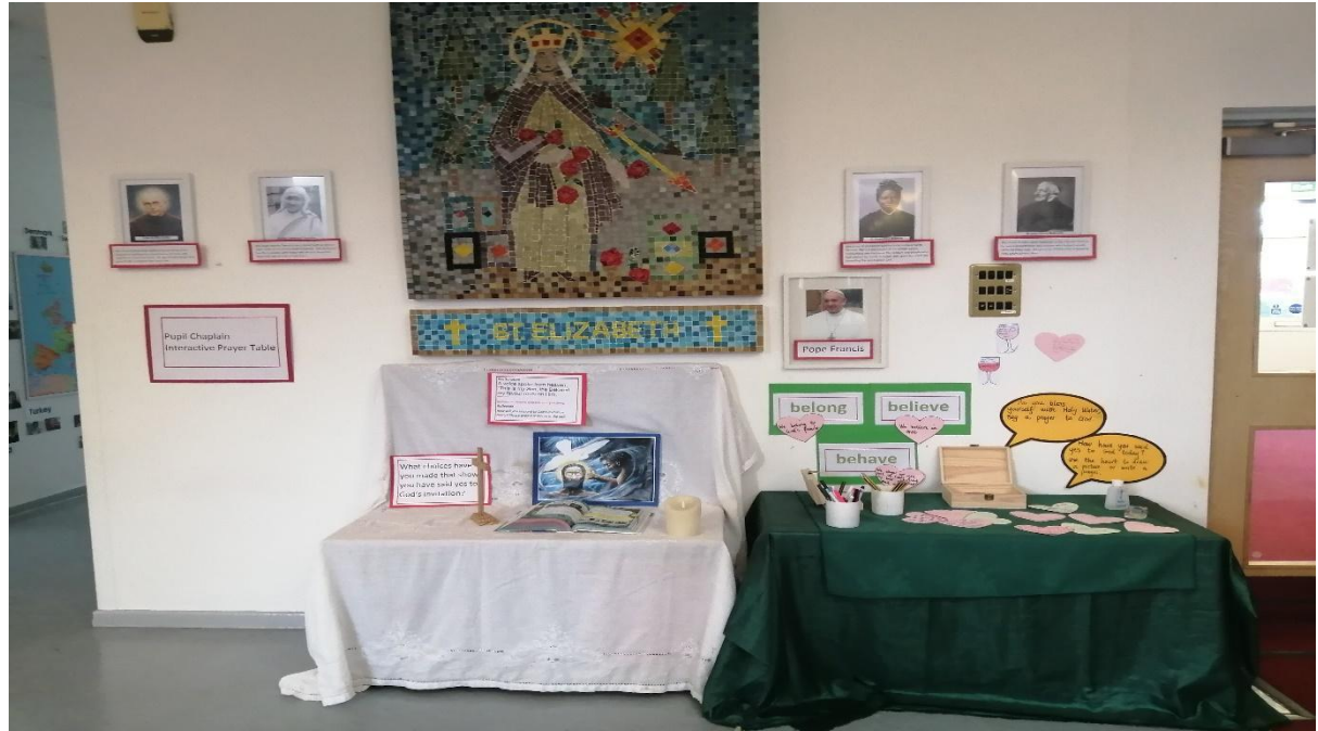
Pupil Chaplains Interactive Prayer Area

As a follow-up from the Gospel assemblies during January and February, the Pupil Chaplains have created an interactive prayer table in the hall where the children are asked to respond to God's invitation to say yes to be part of His family.