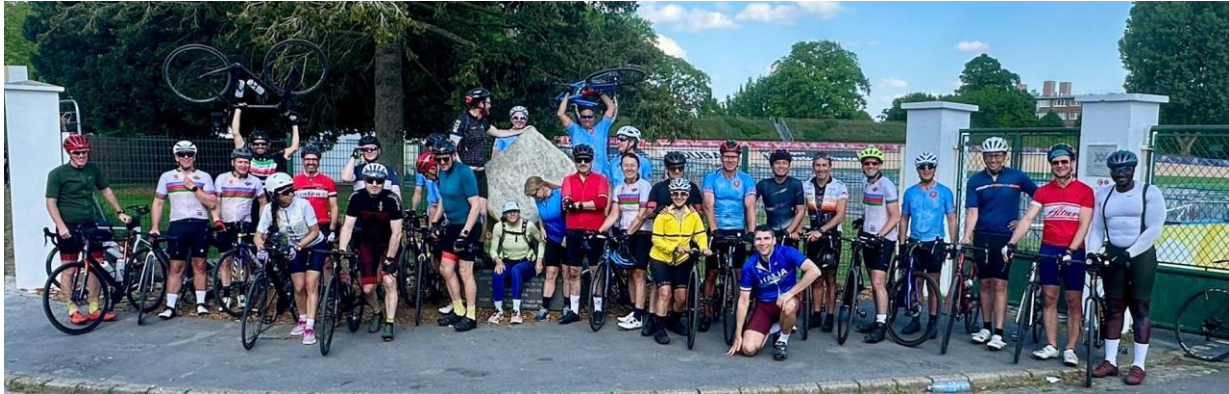
The team of cyclists outside Roubaix Velodrome

Our cyclists have now raised an amazing £7743 for the school. There is still time to show your support for the cyclists by making a donation and sending a message via the JustGiving webpage: https://www.justgiving.com/campaign/richmondtoroubaix2026